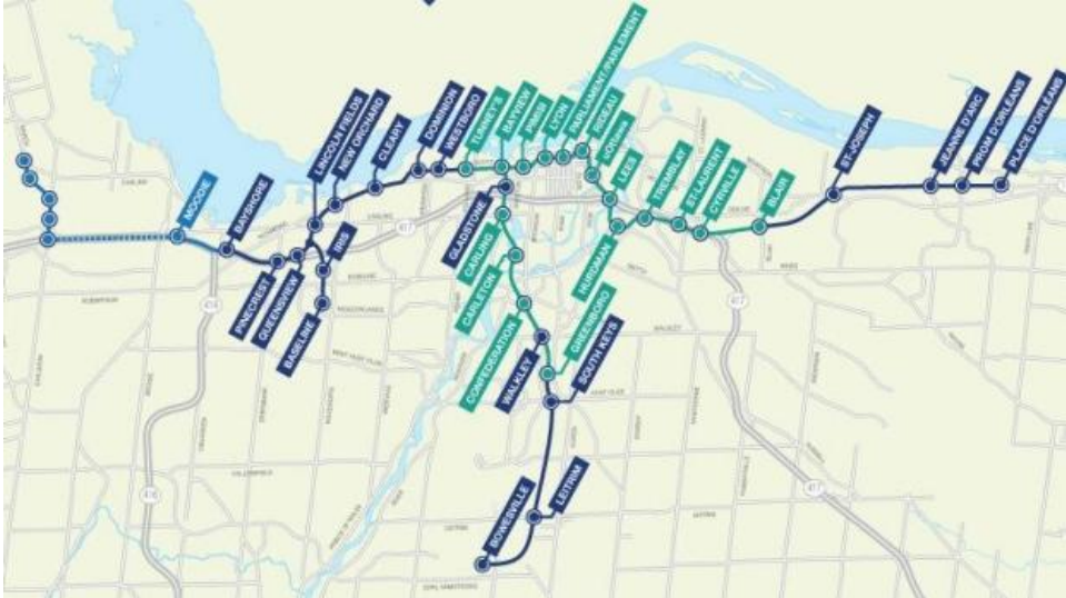
Figure 2: Map of Stage 2 LRT Extension

The Stage 2 Project will build on the Trillium and Confederation Lines and will add 30 km of new rail and 19 new stations to Ottawa’s O-Train system. The goal of this expansion is to bring ~70% of the City’s population within five kilometers of rail transit by 2023. This nearly doubles the number of residents who will be within five kilometers of rail from the completion of Confederation Line.